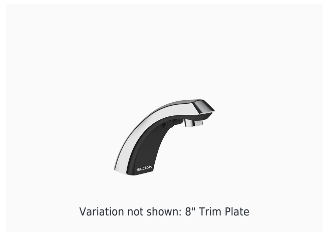
Variation not shown: 8" Trim Plate